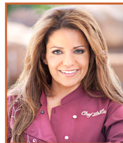
Featuring Celebrity Chef LaLa

For questions or tickets by phone: call 626.792.2687 ext.112