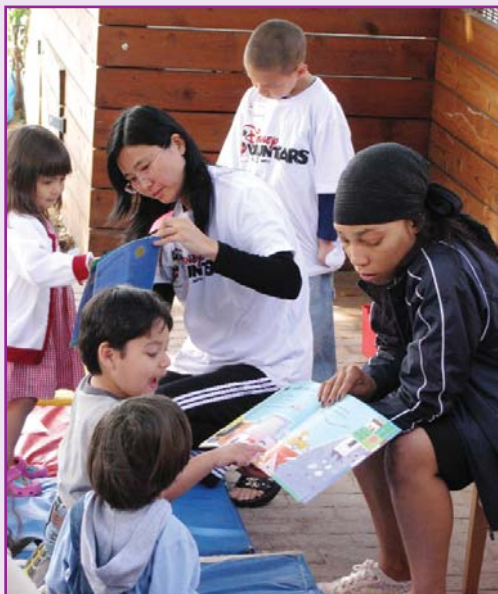
Volunteers from Disney Store, National Charity League, Junior League and others read with families in our Early Readers Book Club.