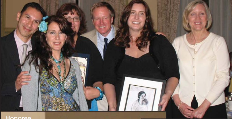
Emcee Joely Fisher with Disney Store Headquarters Employees