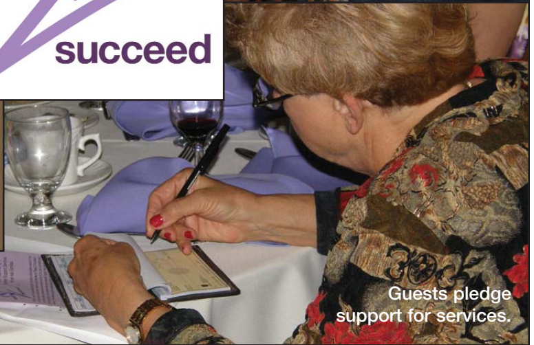
Guests pledge support for services.