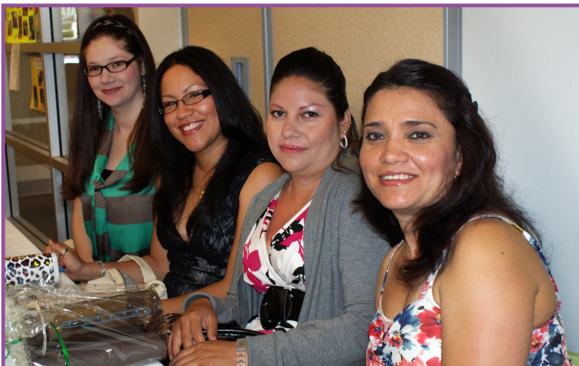
Mothers' Club moms at the Parent Recognition Luncheon