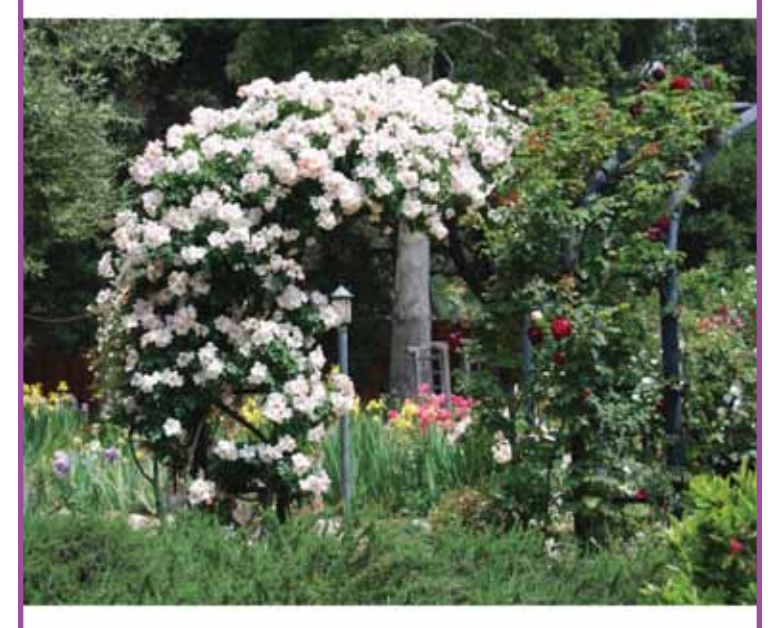
Descanso Gardens { beautiful in every season }

Thank you for educating and empowering families in our community.