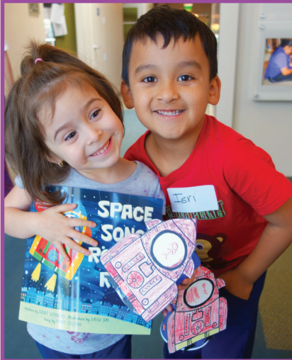
ERBC participants showing off their new books

Family Literacy is an inter-generational, community literacy model that brings adults and children together to learn, beginning before traditional school settings and continuing as a life long process. Mothers' Club has been carefully crafting and transforming this model since its inception in 1961.