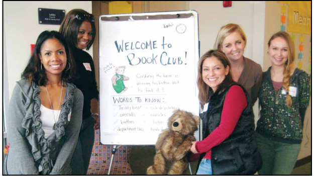
Junior League and National Charity League Members volunteer at our Saturday Early Readers Book Club

Across our programs, children and parents met or exceeded their learning benchmarks, demonstrating children's readiness for school and parents' readiness to support their children's education, as well as their own personal development. Examples include: